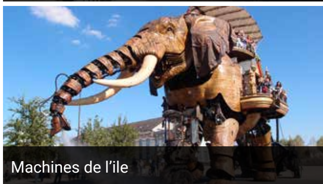
Machines de l'île