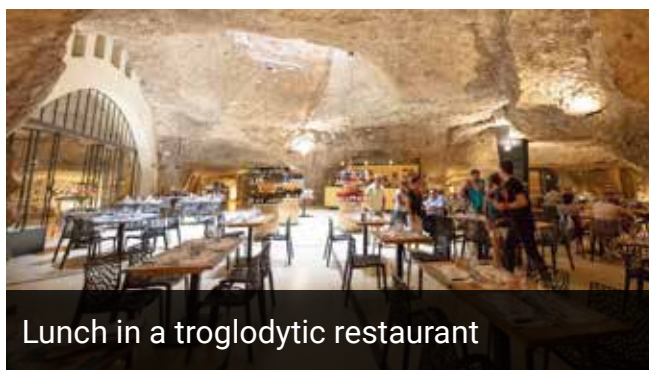
Lunch in a troglodytic restaurant