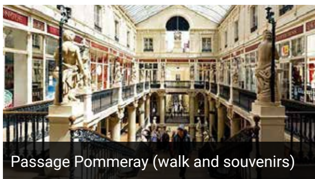
Passage Pommeray (walk and souvenirs)