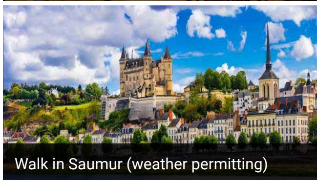
Walk in Saumur (weather permitting)