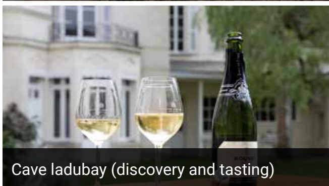
Cave ladubay (discovery and tasting)